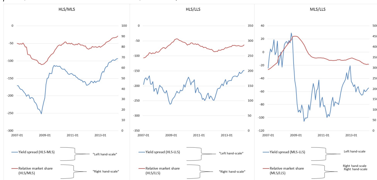
Figure 1. Relationship of yield spreads to relative market shares (yield spreads are in percentage points, relative markets shares are in %, euro area)

By refining the analysis and considering more groups (see Table 1), the correlation between yield spread and the corresponding relative market share in the euro area stood above 50% for four pairs of products out of ten, between 15% and 50% for three pairs and was almost null for one pair. Only two pairs display noticeable negative correlations (between -15% and -25%) and both involve deposits with agreed maturity over two years. These two negative correlations could perhaps result from inadequate financial education, low confidence in the resilience of the banking system (the latter implies a high preference for liquidity regardless of the level of the yield spreads) or/and the distortion of yields by tax policies. All in all, monetary policy transmission mechanisms seem to be effective in the trade-off between most of the saving products available on the market.